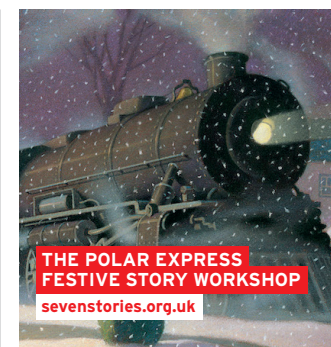
THE POLAR EXPRESS FESTIVE STORY WORKSHOP sevenstories.org.uk

Live Theatre, Broad Chare, Quayside, Newcastle NE1 3DQ 0191 232 1232 Map: F5 Central Station Law Courts