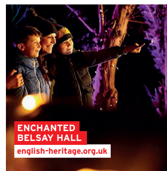
ENCHANTED BELSAY HALL english-heritage.org.uk

5 - 22 December Make the most of winter evenings this December with an enchanting experience of light, colour and sound as Belsay Hall, Castle and Gardens is transformed into an illuminated world.