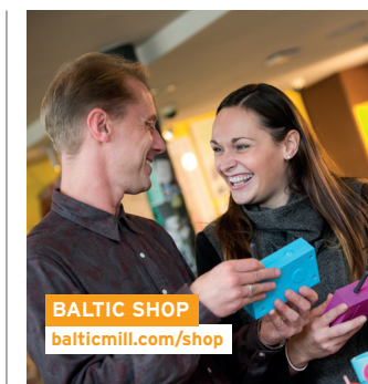
BALTIC SHOP balticmill.com/shop

Seven Stories, The National Centre for Children's Books, 30 Lime Street, Ouseburn Valley, Newcastle, NE1 2PQ 0300 330 1095 (ext 300) Map: H4 Manors Gateshead City Road