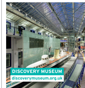
DISCOVERY MUSEUM discoverymuseum.org.uk

BALTIC Centre for Contemporary Art, South Shore Road, Gateshead, NE8 3BA 0191 478 1810 Map: G6 Gateshead Baltic Square