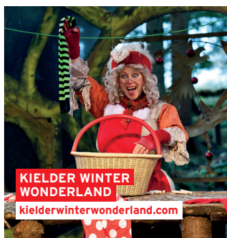
KIELDER WINTER WONDERLAND kielderwinterwonderland.com

Belsay Hall, Castle and Gardens, Belsay, Nr Morpeth, Northumberland, NE20 ODX 0370 333 1181