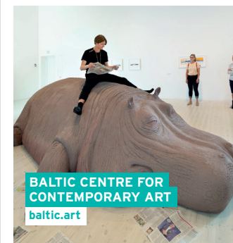
BALTIC CENTRE FOR CONTEMPORARY ART baltic.art

Durham Road, Low Eighton, Gateshead, NE9 6AA