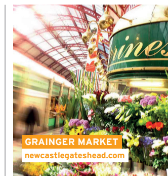
GRAINGER MARKET newcastlegateshead.com

BALTIC Centre for Contemporary Art, South Shore Road, Gateshead, NE8 3BA 0191 440 4947 Map: G6 Gateshead Baltic Square