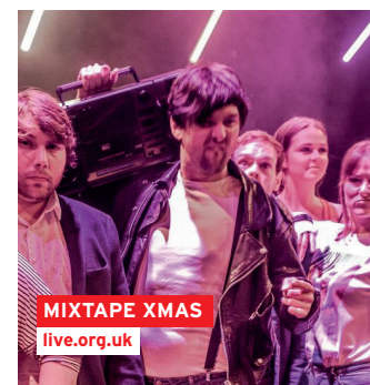
MIXTAPE XMAS live.org.uk

Landal Kielder Waterside, Kielder Water & Forest Park, Northumberland, NE48 1BT 0800 111 4149