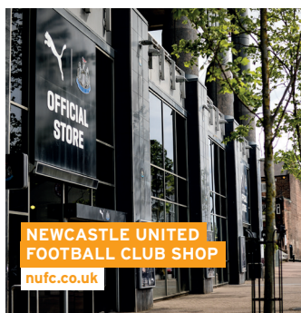
NEWCASTLE UNITED FOOTBALL CLUB SHOP nufc.co.uk

Intu Metrocentre, Gateshead, NE11 9YG 0191 493 0200 Map: D9