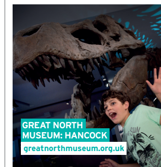
GREAT NORTH MUSEUM: HANCOCK greatnorthmuseum.org.uk

Blandford Square, Newcastle, NE1 4JA 0191 232 6789 Map: B6 Central Station Central Station