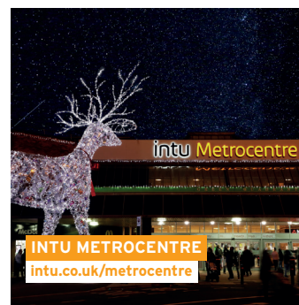
INTU METROCENTRE intu.co.uk/metrocentre

Grainger Street, Newcastle, NE1 5JG Map: D4 Monument Theatre Royal