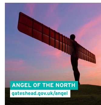
ANGEL OF THE NORTH gateshead.gov.uk/angel

St. James' Park, Newcastle, NE1 4ST 0344 372 1892 Map: B4 St James Newgate Street