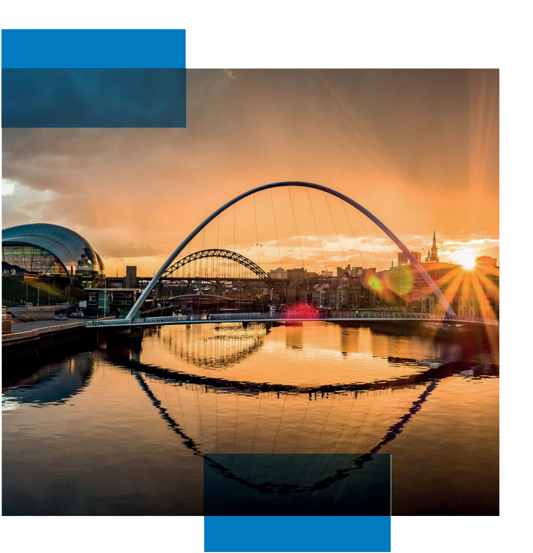
Digital Rate Card 2019/20